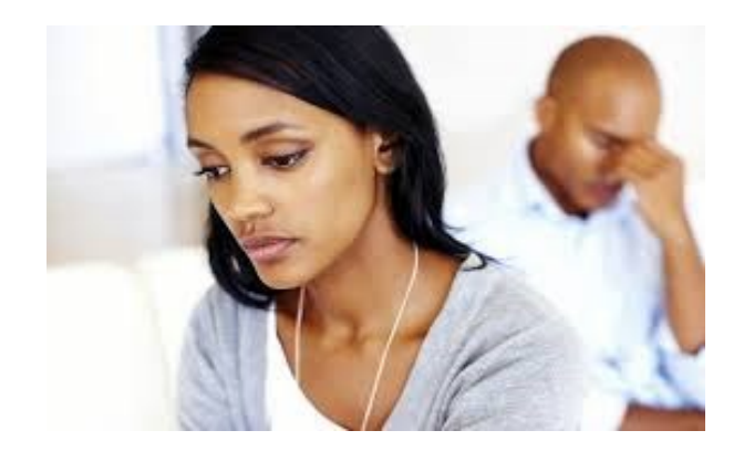
"Cast your cares on the Lord and he will sustain you". Psalm 55:22

Looking for ways to improve and enhance your personal relationships: spouse, child, friend or co-worker?